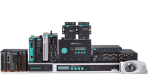
Industrial Edge Connectivity