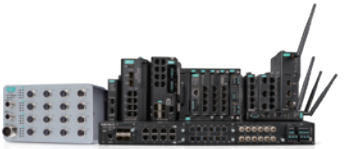
Industrial Network Infrastructure